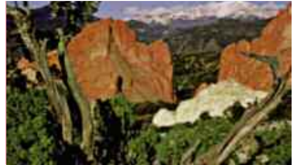
Visit the Garden of the Gods where the Rockies begin.