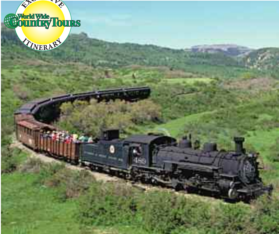
Relax on the steam-driven Cumbres & Toltec Scenic Railroad.