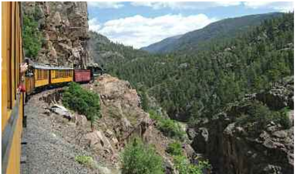
Wind your way through the lush San Juan National Forest on the Durango & Silverton Train.

Make sure there's plenty of film in your camera today as we ride on "North America's most scenic railroad"—the world-famous Royal Gorge Route! From the comfort of your enclosed coach seat or open-air observation car, you'll enjoy fabulous scenery and wildlife, and be pampered by the outstanding train staff. Our classic, old-time diesel engine chugs along the mighty Arkansas River and it winds its way through the steep granite cliffs of the gorge. Along the way, we'll pass under the Royal Gorge Bridge, suspended more than 1,000 feet above the tracks. Meals included: B, L.