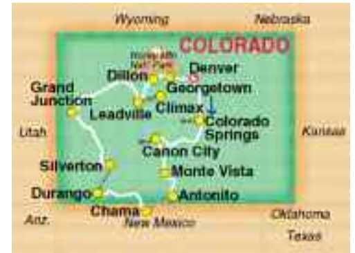
Elevations reach 14,110 feet on this tour at Pikes Peak. high 82°/low 50°

Immerse yourself in yesteryear with the Durango & Silverton Narrow Gauge Railroad Museum's awesome memorabilia, including full-size locomotives, maps, photos and artwork. Then it's "all aboard!" Gaze in awe as we make our way through